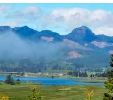
Top to bottom: Nehalem Bay Health Center & Pharmacy's patient transport van; Weekly North County Walking Group; NKN Student Health & Wellness Center; Community Wellness Class farm tour; Nehalem Bay (the view that inspired our logo).